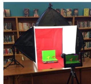
Stop Motion Animation Equipment

This project is supported by funds from the New Jersey State Library and LibraryLinkNJ.