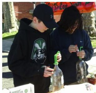
Bead Making at Green Festival